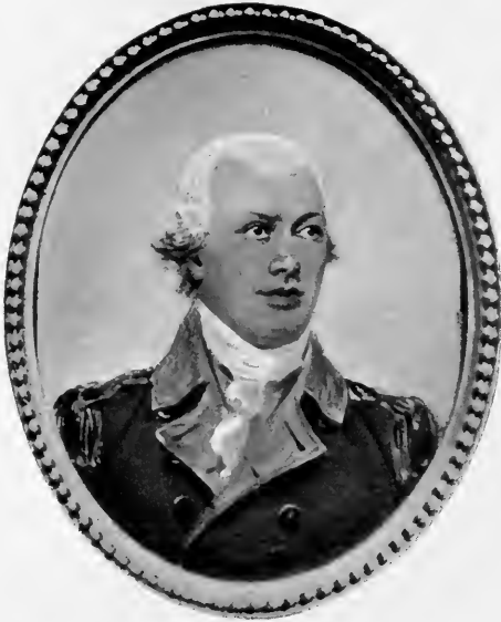
Major-General Nathanael Greene By John Trumbull Page 113